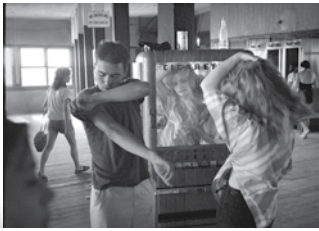
BRUCE DAVIDSON BROOKLYN GANG 1959