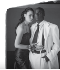
MARY ELLEN MARK PROM